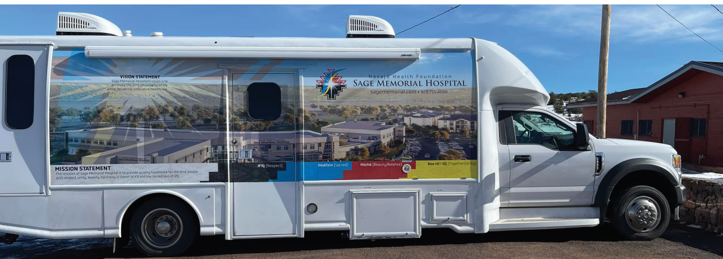
PHOTO - Mobile health unit providing services to the community of Nazlini.

GANADO, Ariz. — We are thrilled to announce that the Mobile Health Unit will be back on the road in 2024 to bring vital healthcare services directly to communities. Our mission is to ensure that everyone, no matter where they are, has access to quality healthcare. We have an action-packed schedule for the first quarter, from January to March, with regular stops at various chapters.