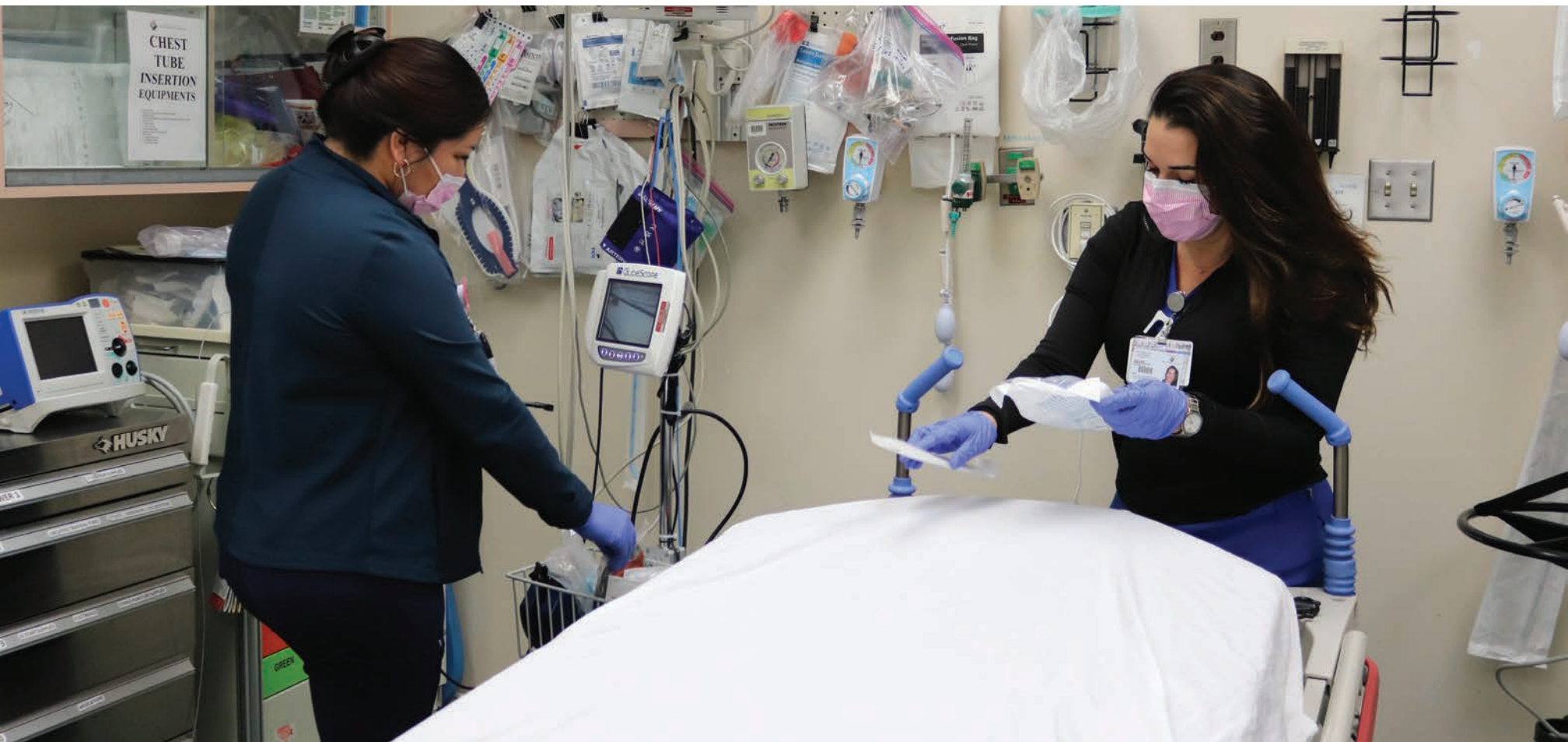
PHOTO - Sage Memorial Hospital Nurses prep rooms with various instruments, and supplies to be used during patient visits.