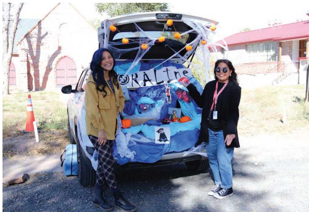
PHOTO - Various photos from the Trunk-or-Treat event.