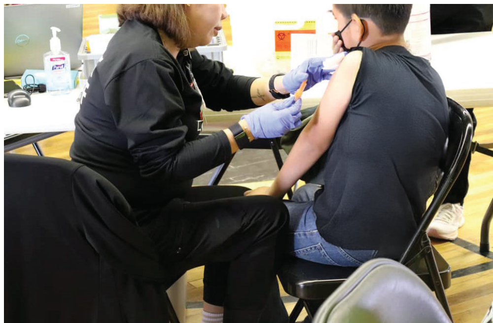
PHOTO - Nurse administering flu shot at Sage Memorial Hospital's 2024 Mass Flu/COVID Event

For more information on Sage Memorial Hospital's vaccination events and services, please visit www.sagememorial.com/flu .